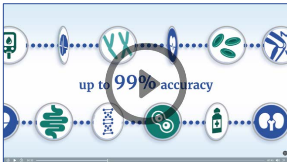
Learn about the Essential Genomic screenings (Click to watch)