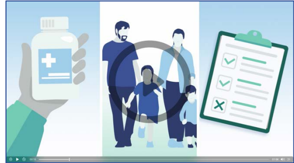
What to expect when getting started (Click to watch)