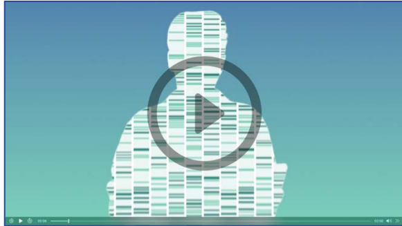
Who is Genomic Life (Click to watch)